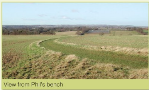
View from Phil's bench

The path takes you up a gentle incline, pause at Phil's bench 4 to enjoy the views across the farmland. On a clear day you can see across to the Chiltern Hills. Landmarks such as the Lister Hospital and the golf course can be spotted.